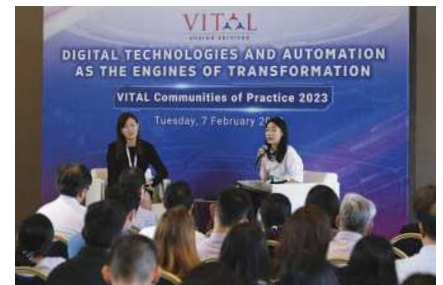
VITAL CoP 2023 was attended by about 130 corporate services leaders from more than 50 public agencies