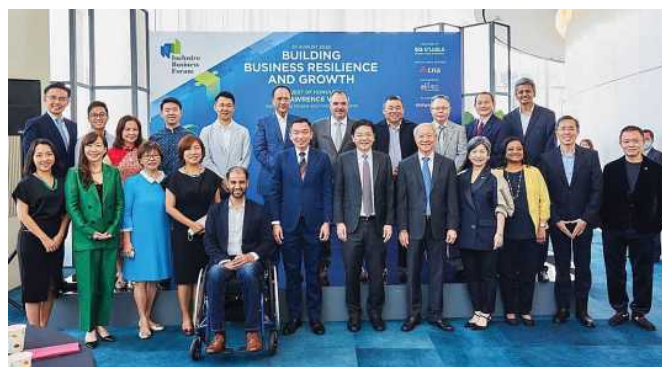
VITAL recognised as a good example of public service embracing inclusive hiring at Inclusive Business Forum 2022