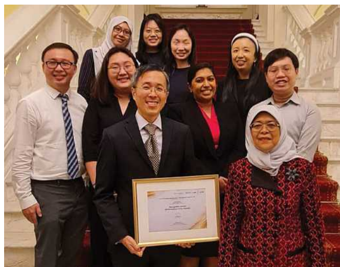
VITAL team received Recognition Award of HR Powerbank Early Adopter from President of Singapore

We are humbled by the recognition, a testament to our practices in embracing disability-inclusive hiring. We look forward to working with like-minded organisations on this meaningful journey.